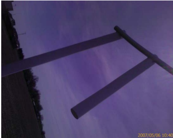
Flatlanders Sculpture in Blissfield: The world of the Gray

This “World of the Gray” -- this shade of gray is the Positive Darkside. The Positive Darkside is the middle ground between being dictatorial and being too kind . The Positive Darkside is showing your fangs when it is appropriate... killing and eating when it is appropriate, using the gun when you have to, manipulating with great glee when it is necessary and virtuous. It is that side that sometimes thinks you are God. It is the side of you that does think evil thoughts angry thoughts, negative thoughts, and is able to recognize them – embrace them as yours and dance with them.